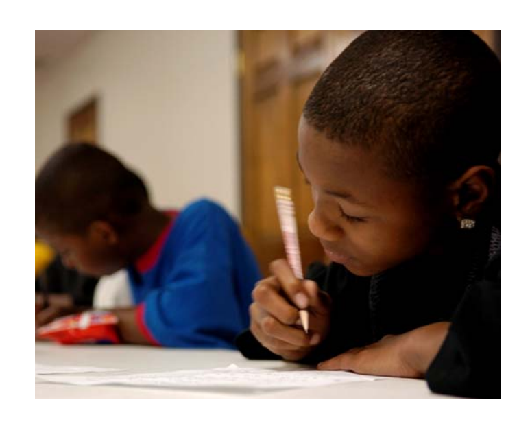
Access to Economic Opportunity Educational Opportunity Identity, Gender and Character Development

HOWARD HEINZ ENDOWMENT - VIRA I. HEINZ ENDOWMENT African American Men and Boys Task Force Request for Proposals