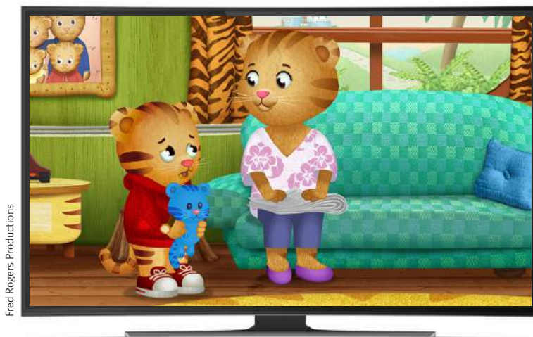
In 2020, the Fred Rogers Productions cartoon special “Won’t You Sing Along with Me?” Daniel Tiger’s mother talks to her disappointed son about why the neighborhood carnival had closed, though without explicitly mentioning the COVID-19 pandemic.